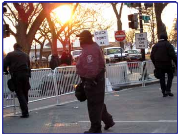
Officers take their positions at a check point along the parade route.