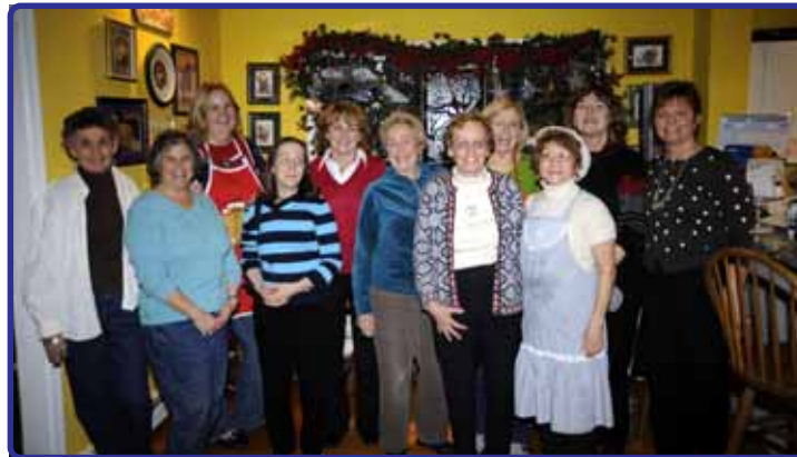
Gaywood Garden Club Members