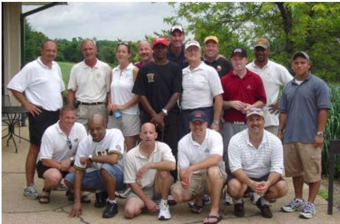
Park Police Officers and recuperating Iraq War veterans gather at Northwest Park Golf Course before playing 18 holes.