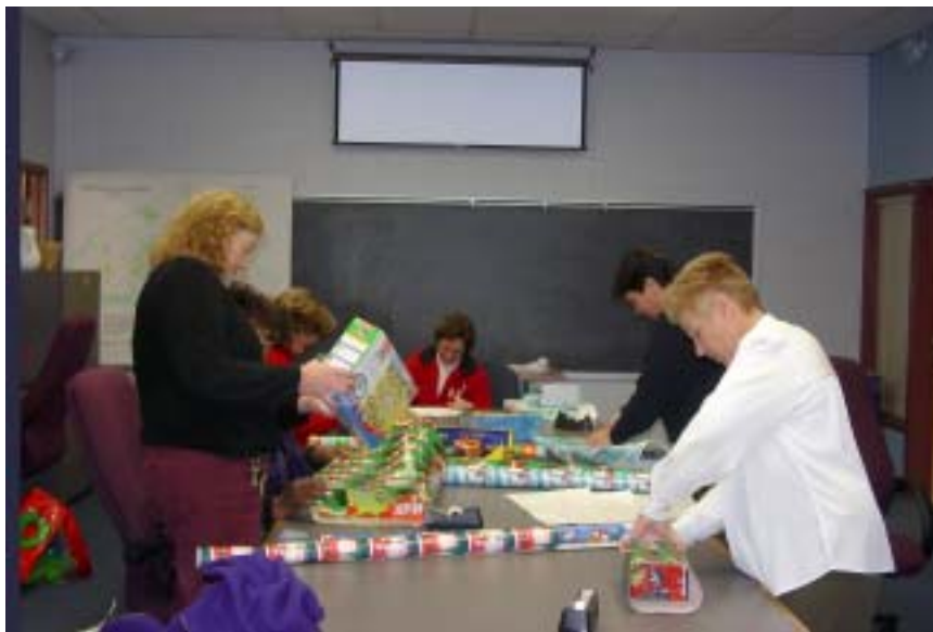
Santa's helpers wrap and organize gifts.